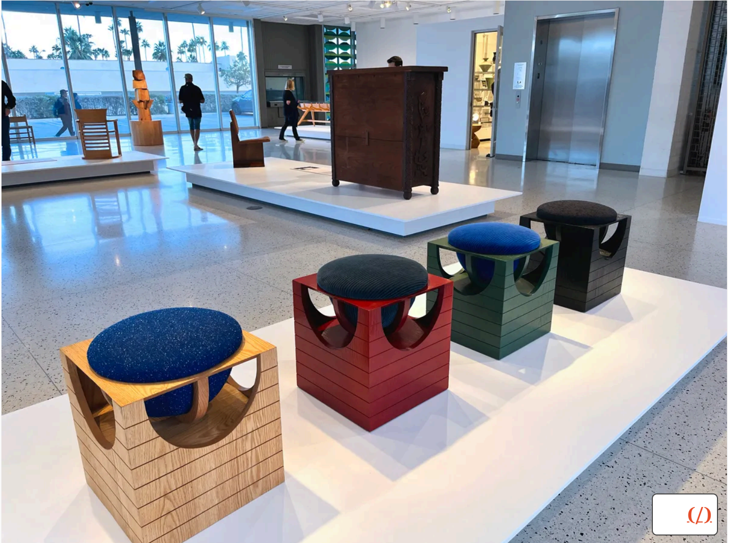
Ryan Preciado, Sandoval stools , 2024, installation view.