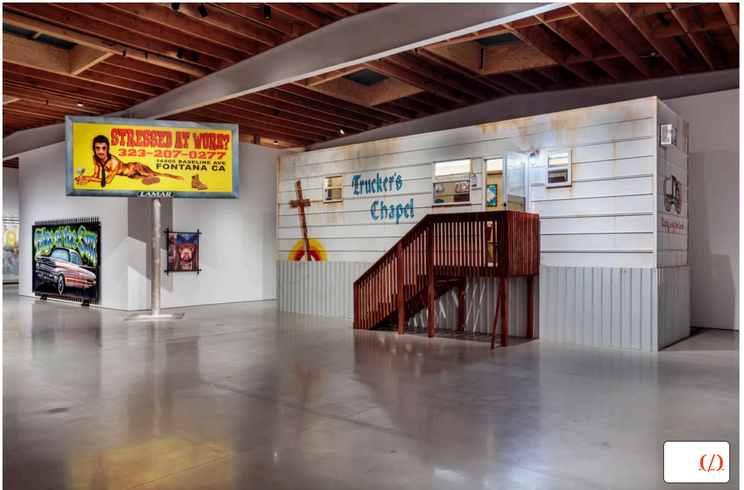
Installation view of "At the Edge of the Sun," 2024, at Jeffrey Deitch, Los Angeles.