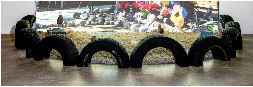
Installation view of “Where I Learned to Look: Art from the Yard,” 2024, at ICA Philadelphia.