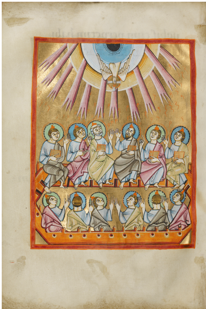
J. Paul Getty Museum 'Lumen: The Art & Science of Light': "Pentecost," from Benedictional, Ottonian, about 1030–1040.

We also highly recommend that you head south and even stay for a day or two or longer for deep-dive experiences into the multiverse. A good place to start is the Getty Center in Los Angeles, where you can view eight PST Art installations (the Lumen: The Art and Science of Light exhibition, which explores light sciences in the Middle Ages, is especially enlightening). Nearby, at UCLA in Westwood, the Fowler and Hammer museums and other institutions present Breath [e]: Toward Climate and Social Justice , Science Fiction Against the Margins , Atmosphere of Sound: Sonic Art in Times of Climate Disruption , and Fire Kinship: Southern California Native Ecology and Art .