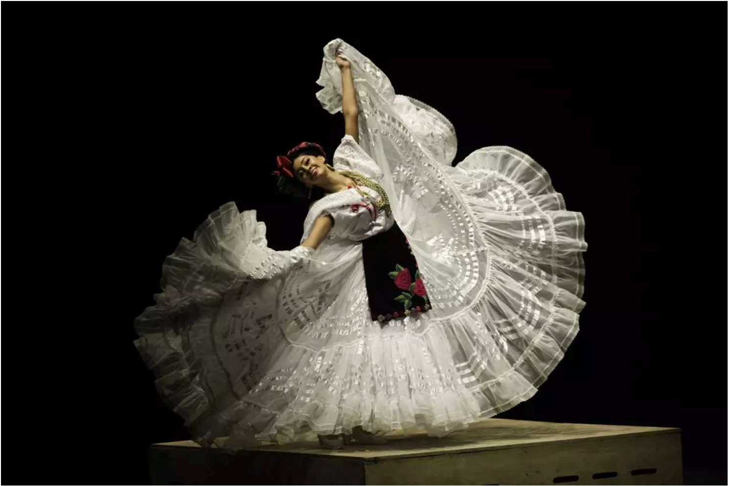
Ballet Folklórico de Mexico . (Ballet Folklórico de Mexico )