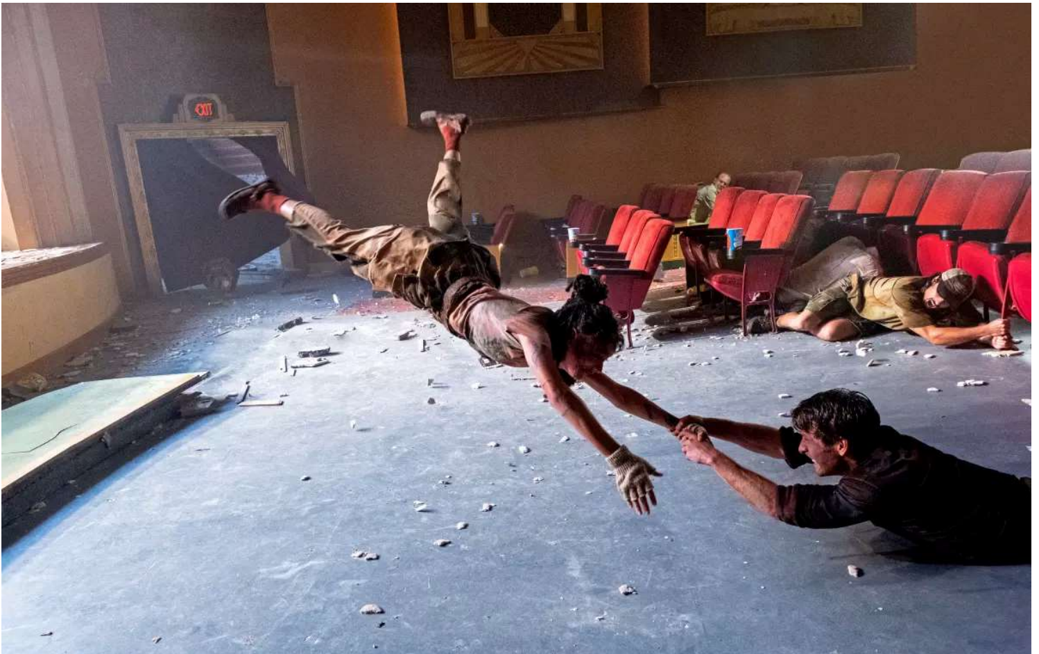
Lily (Sasha Lane) and Tyler (Glen Powell) get sucked up by a tornado in a scene from "Twisters."

Twisters Daisy Edgar-Jones, Glen Powell and Anthony Ramos star in "Minari" director Lee Isaac Chung's standalone sequel to the 1996 hit about storm chasers in the American heartland.