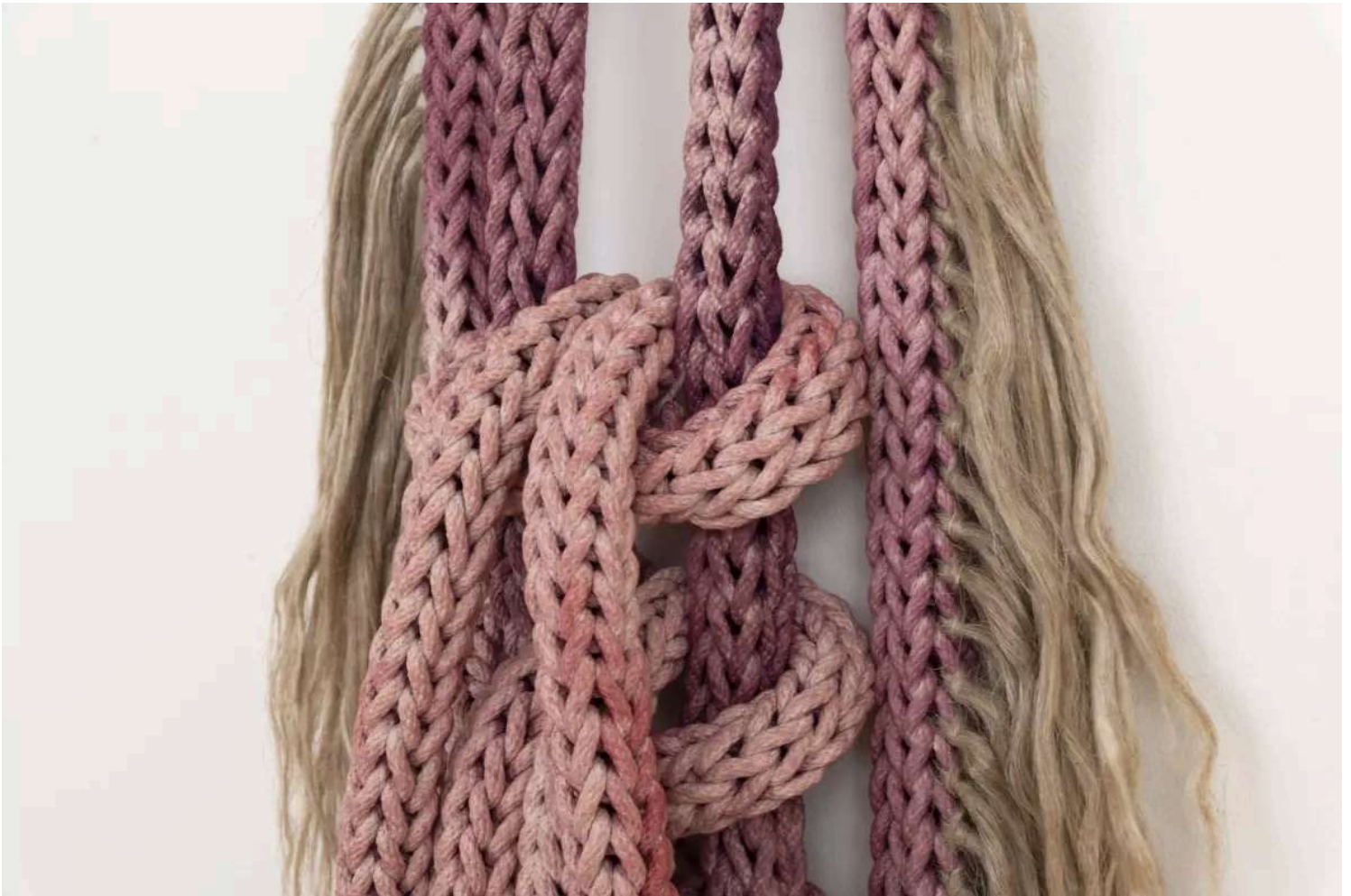
“Cosas que Sangran” by artist Tanya Aguiñiga consists of braided cotton rope, cochineal dye and heckled flax. ( Tanya Aguiñiga and Volume Gallery, Chicago)