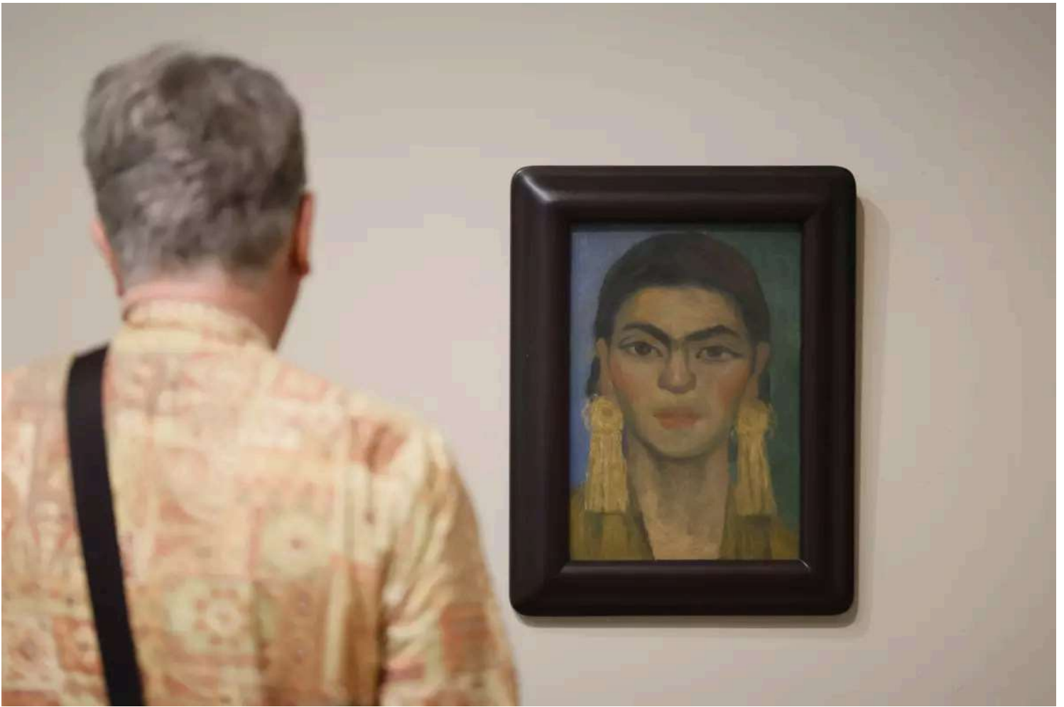
A visitor views the Los Angeles County Museum of Art's sole Diego Rivera portrait of Frida Kahlo at LACMA at the museum.