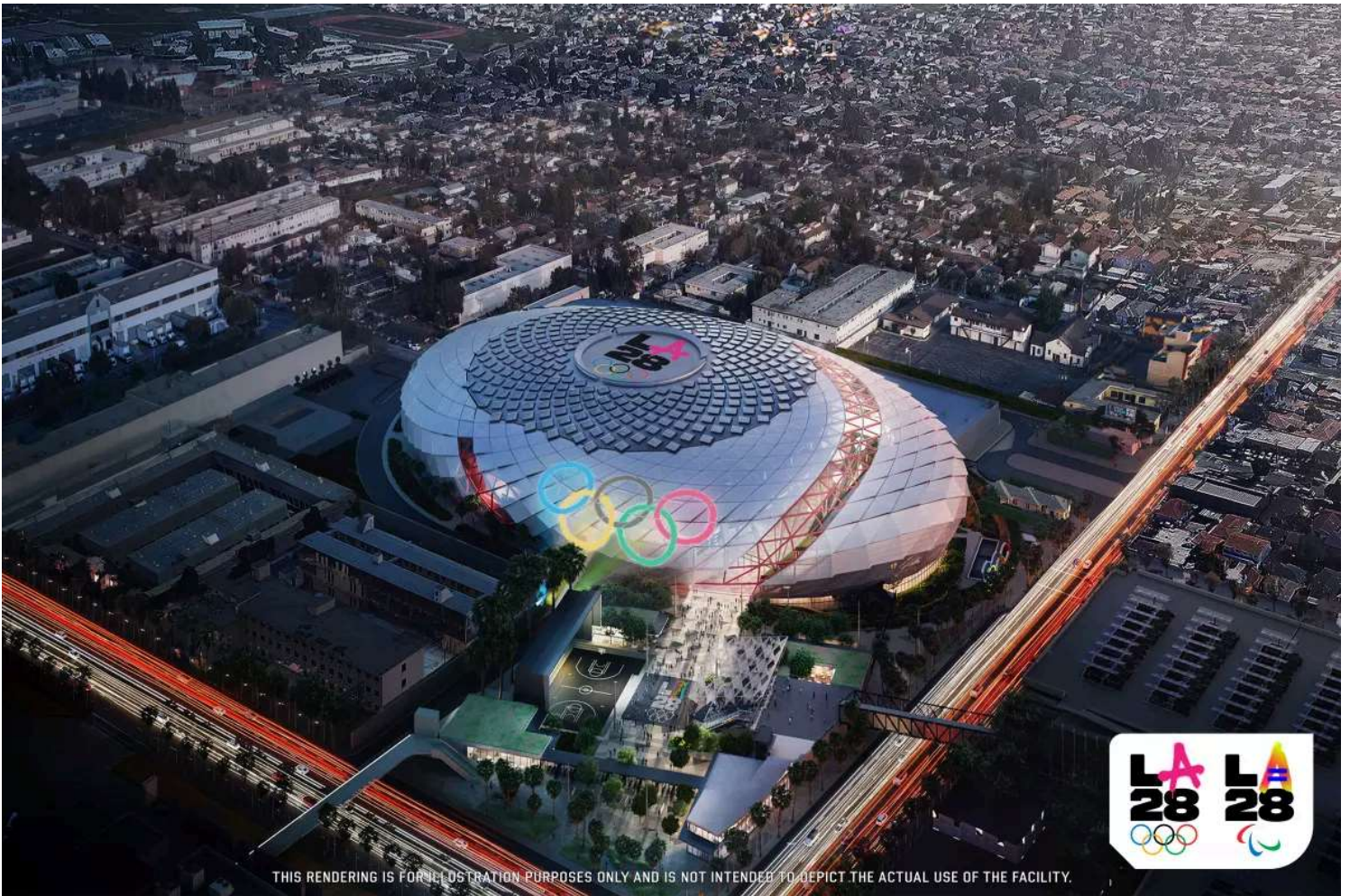
An artist's rendering of the Intuit Dome, which will host basketball events at the 2028 Los Angeles Olympic Games.