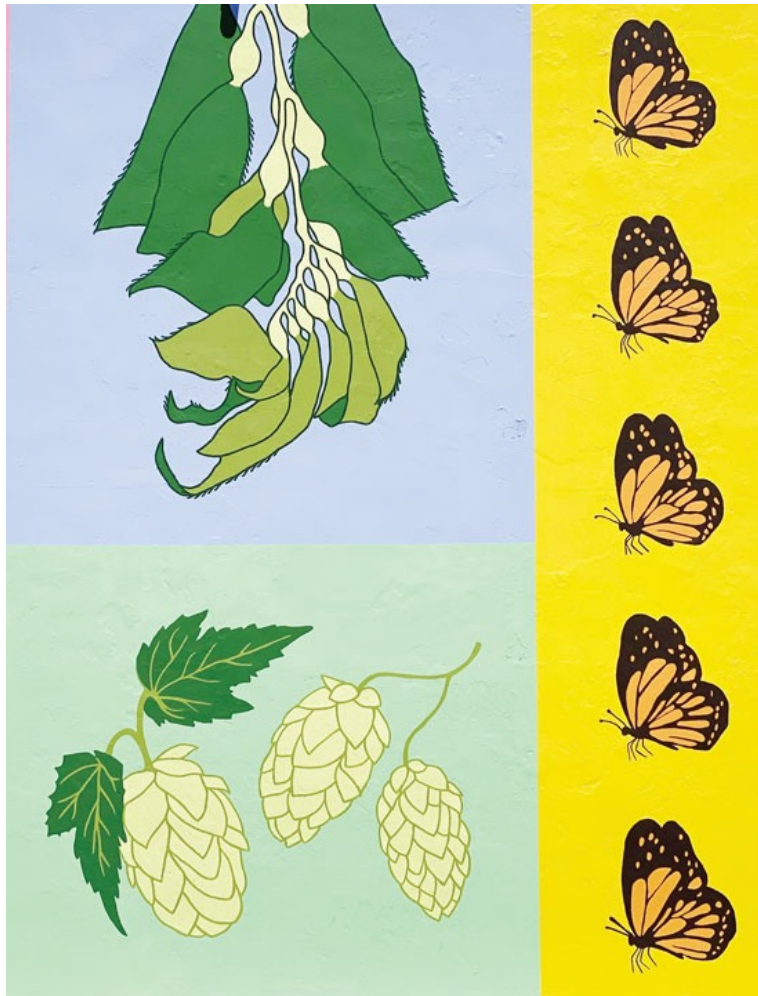
The artist included local nature elements, like the Monarch Butterfly and kelp forest, in their design of the mural.

Both artists come from unique creative backgrounds, and neither creator specializes in painting. Ms. Borfiga uses screen printing to create colorful nature-inspired pieces, while Ms. Arriaga is a contemporary Chicana artist who uses graphic design mediums to create portraits and images of human forms.