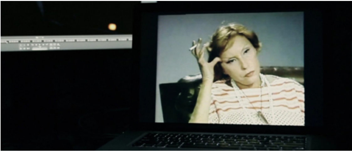
Lisa Tan, Sunsets , 2013, HD video with sound, Courtesy the Artist