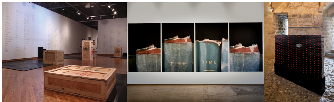
Left to right: Jorge Mendez Blake, All the Poetry Books , 2010, Museum of Latin American Art, Los Angeles, USA, Courtesy the Artist; Mickey Smith, Collocation No.12 (TIME I) , 2009, Archival Pigment Prints on Canvas, Four 81 x 54 in. panels, Courtesy of Invisible-Exports.; Carlos Garaicoa, The Most Beautiful Sculpture is the Brick We Throw at the Face of the Cops , 2009, Books, one paved stone, wood, 57 x 75 x 10 3/5 in., Courtesy the Artist;

MCASB will also present a video by a Stockholm-based artist that challenges how the limits of language affect the interpretation of creative work in Bloom Projects: Lisa Tan, Sunsets .