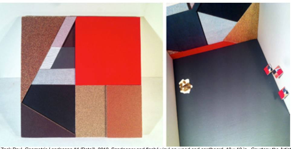
Zack Paul, Geometric Landscape #1 (Detail), 2012, Sandpaper and flashé vinyl on wood and cardboard, 12 x 12 in., Courtesy the Artist (Detail and Top View)