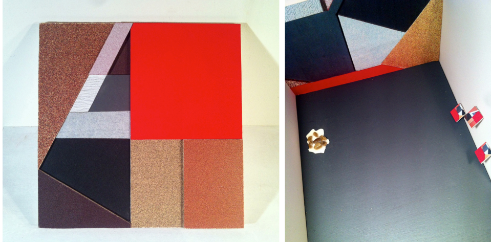
Zack Paul, Geometric Landscape #1 (Detail), 2012, Sandpaper and flashé vinyl on wood and cardboard, 12 x 12 in., Courtesy the Artist (Detail and Top View)